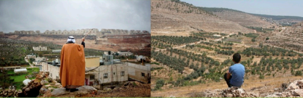
The Friends of Wadi Foquin is requesting the Lantos Human Rights Commission to schedule a hearing on the human rights violations taking place in the village of Wadi Foquin, located in the Bethlehem District of the Occupied Palestinian Territories.